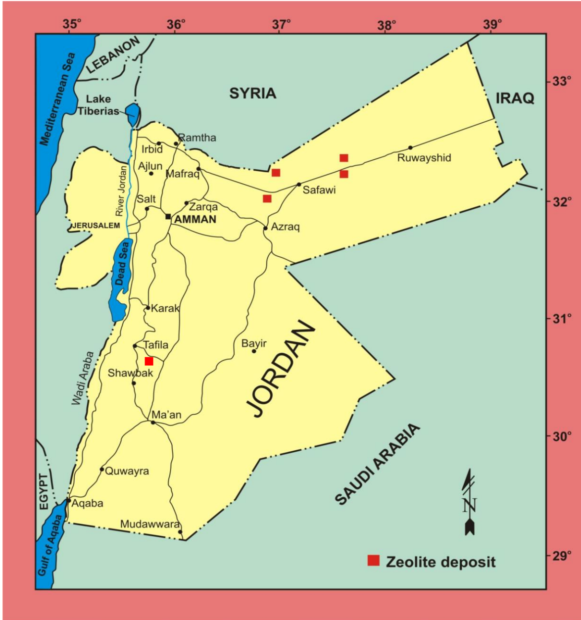
Figure (1): Location map of Zeolitic Tuff deposits in Jordan.