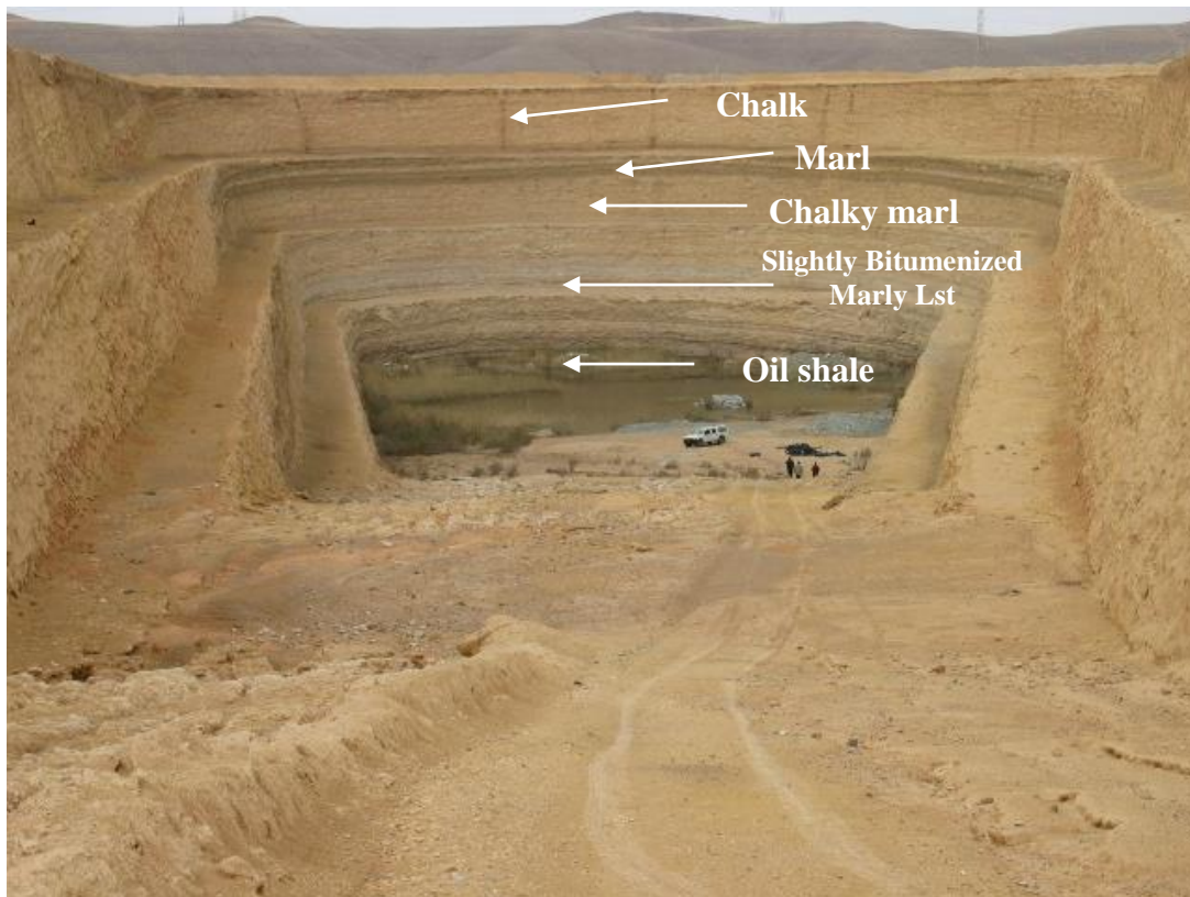
Figure (3): Open pit in Sultani deposit.