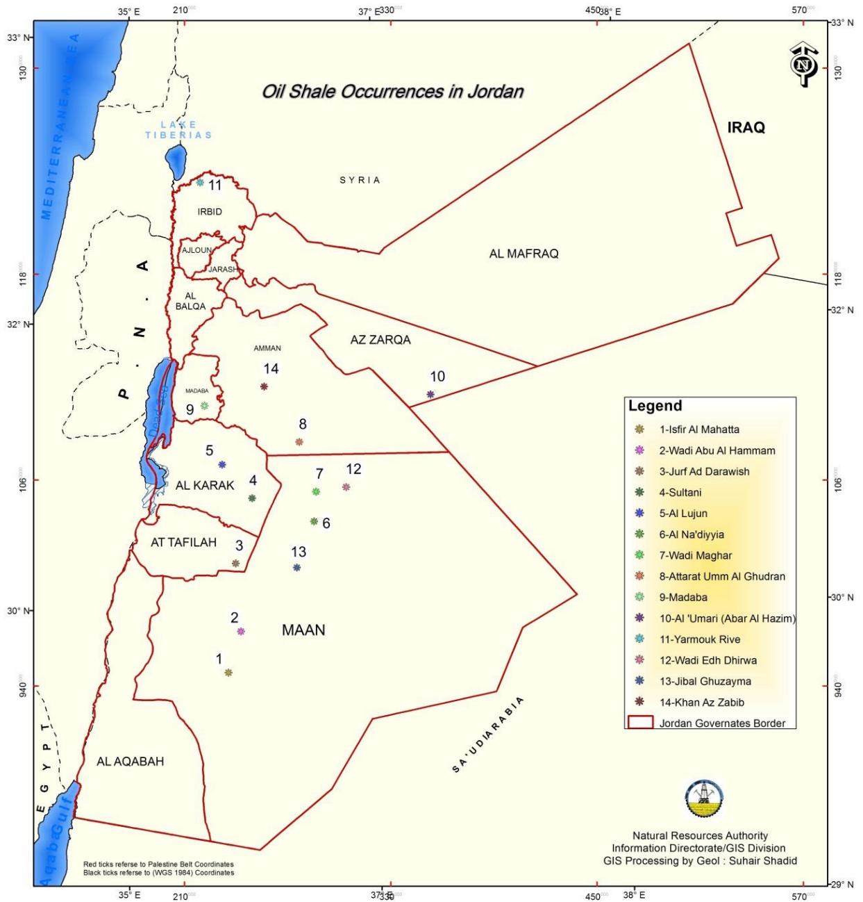
Figure (1): Location map of the major oil shale deposits.